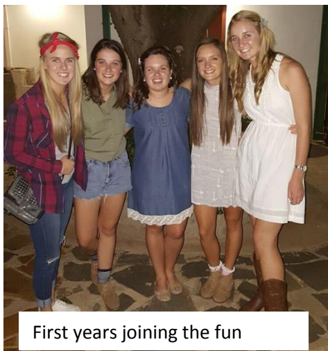
First years joining the fun

Saturday: Our annual informal: PRET-OPPI-PLAAS (fun-on-the-farm)