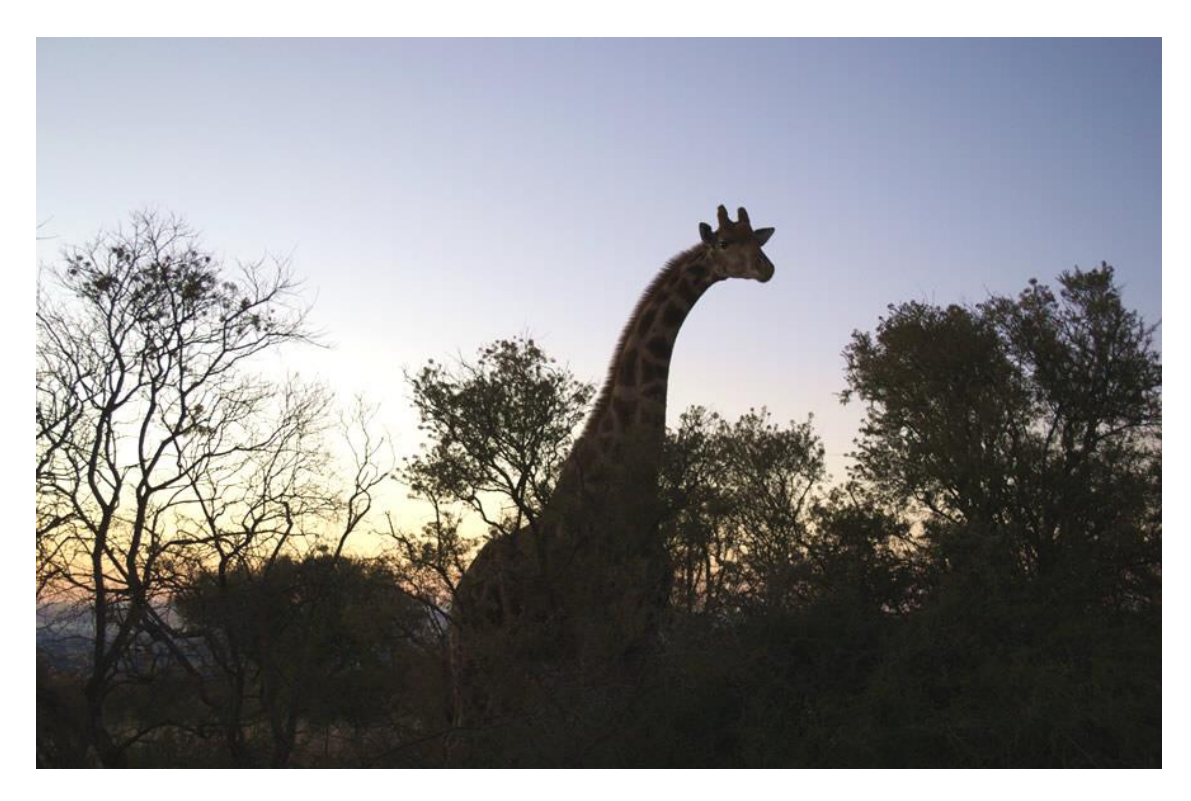
2Giraffe at Franklin Game Reserve at Naval Hill (https://bloemfonteintourism.co.za/naval-hill/)

2) Head to Batho where we will see <u>Thomas Maphikela House</u> and Dirigateng (the place of curtains).