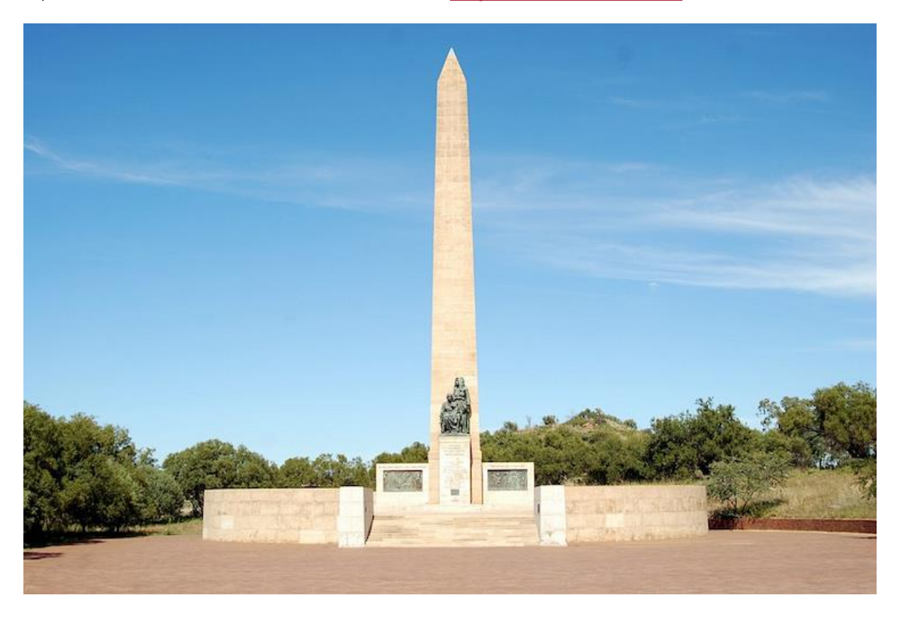
4National Women's Memorial (https://www.historyhit.com/locations/national-womens-memorial-bloemfontein/)

3) Visit the National Women's Memorial and Anglo Boer War Museum.