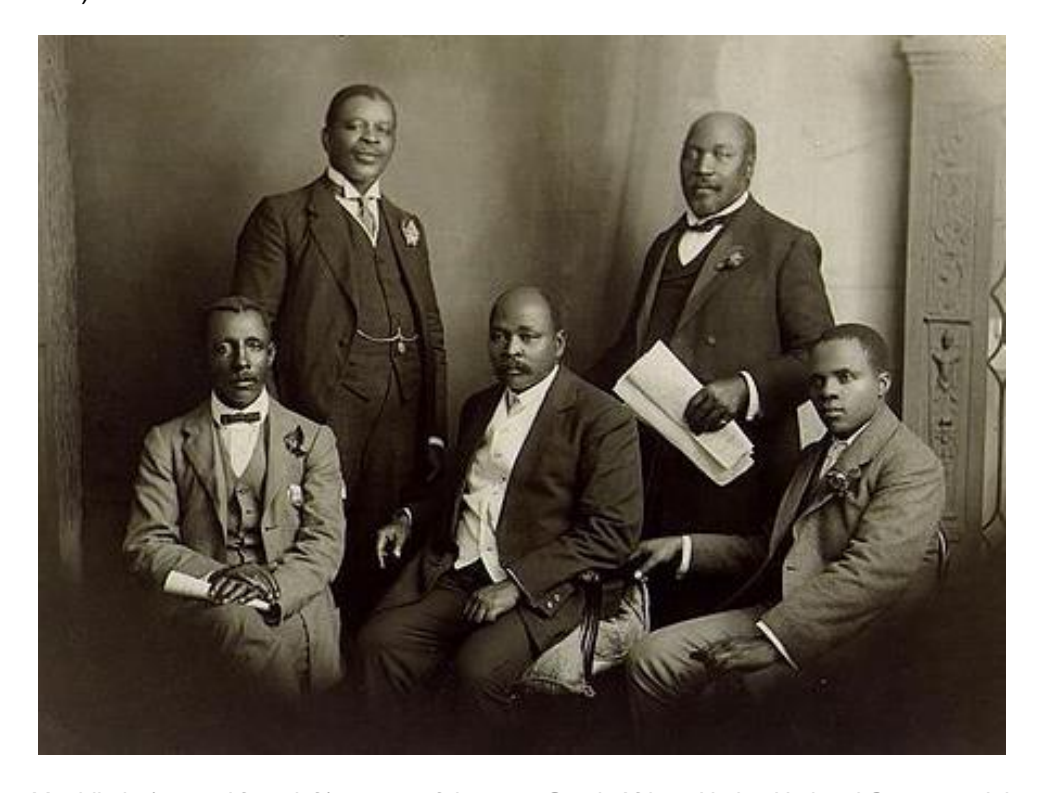
3Thomas Maphikela (second from left) as part of the 1914 South African Native National Congress delegation to Britain (https://en.wikipedia.org/wiki/Thomas_Mtobi_Mapikela)

2) Head to Batho where we will see <u>Thomas Maphikela House</u> and Dirigateng (the place of curtains).