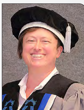
ASSISTANT DEAN: NATURAL AND AGRICULTURAL SCIENCES