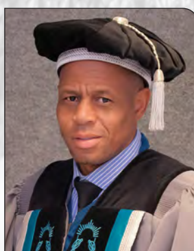
ASSISTANT DEAN: EDUCATION