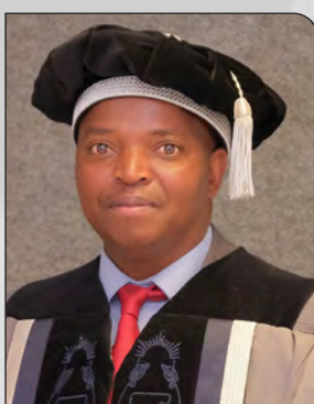
ASSISTANT DEAN: ECONOMIC AND MANAGEMENT SCIENCES