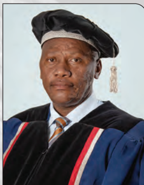
CAMPUS VICE-PRINCIPAL: SUPPORT SERVICES