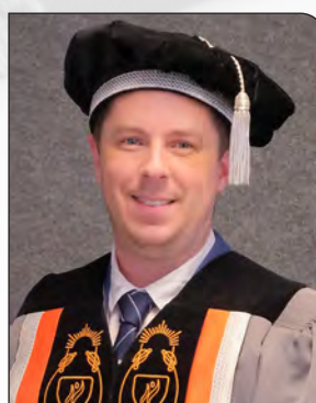
ASSISTANT DEAN: THE HUMANITIES