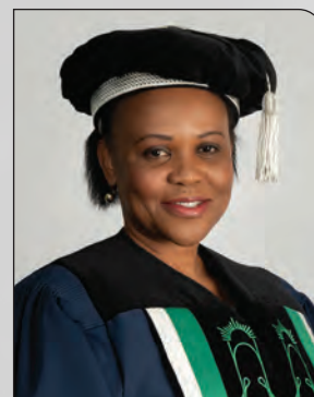
CAMPUS VICE-PRINCIPAL: ACADEMIC AND RESEARCH