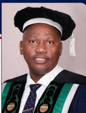
CAMPUS VICE-PRINCIPAL: SUPPORT SERVICES