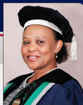
CAMPUS VICE-PRINCIPAL: ACADEMIC AND RESEARCH