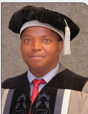
ASSISTANT DEAN: ECONOMIC AND MANAGEMENT SCIENCES