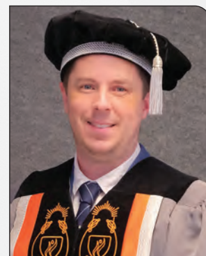
ASSISTANT DEAN: THE HUMANITIES