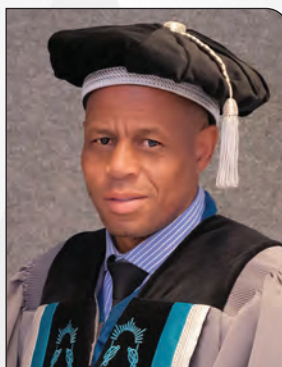
ASSISTANT DEAN: EDUCATION