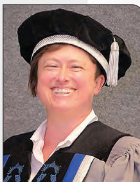
ASSISTANT DEAN: NATURAL AND AGRICULTURAL SCIENCES