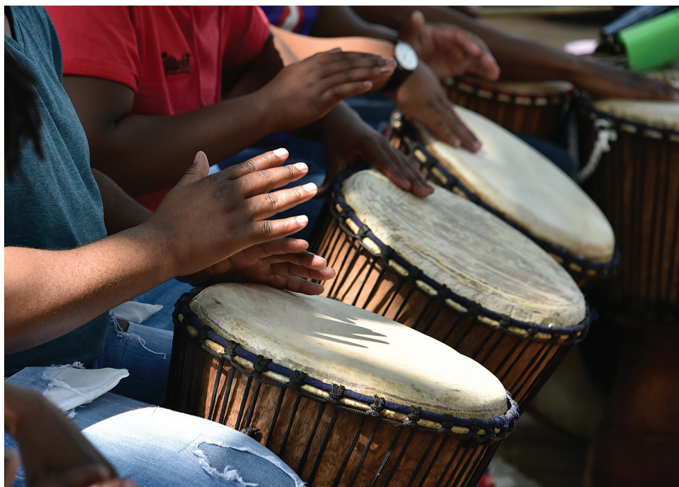
UNIVERSITY OF THE FREE STATE IN BLOEMFONTEIN, SOUTH AFRICA: The University's first Kovsie Multilingual Mokete was a two-day festival that featured art exhibitions, a drumming circle, musical performances, poetry readings, drama productions, food vendors, and a concert by popular local bands—all presented in five languages (English, Afrikaans, Sesotho, Zulu, and sign language).