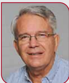
PROF SD SNYMAN DD (PRET) DEAN DEKAAN

NATURAL AND AGRICULTURAL SCIENCES NATUUR- EN LANDBOUWETENSAPPE UFS·UV