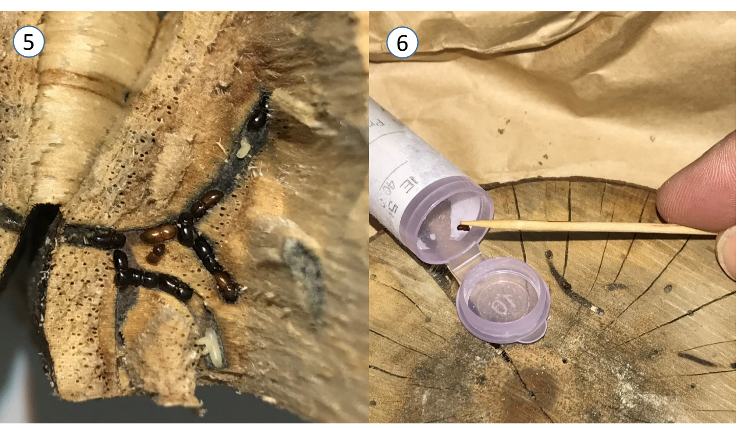
5. If beetles can be seen, catch or take them out with a tweezer or something thin like a toothpick...