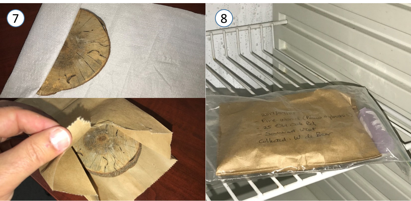
7. Wrap bark and wood pieces individually in paper or put in paper bag, label with info and place in ziplock bags.