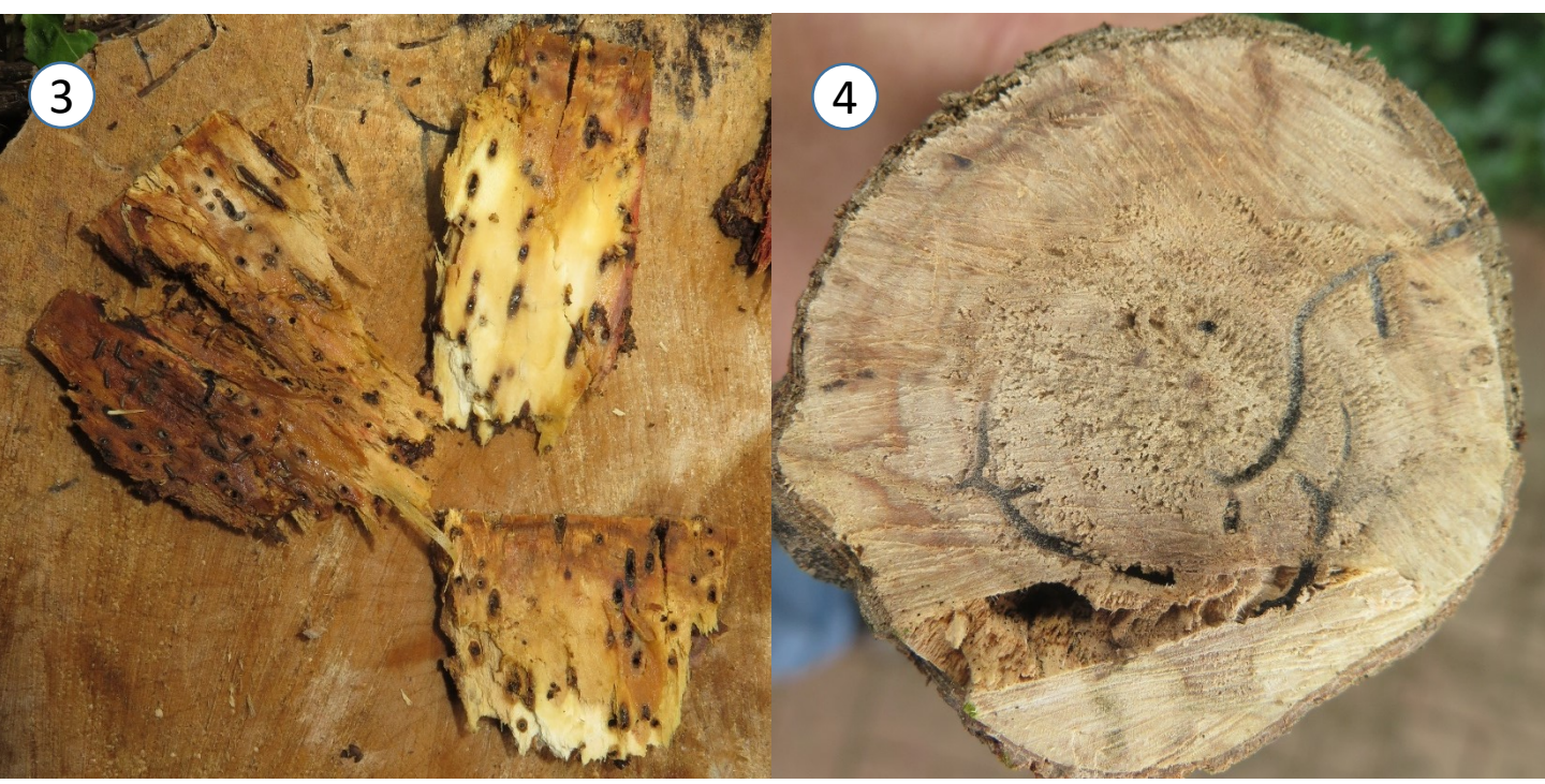
3. Cut or chisel out pieces of infested wood.