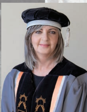
DEAN: THE HUMANITIES