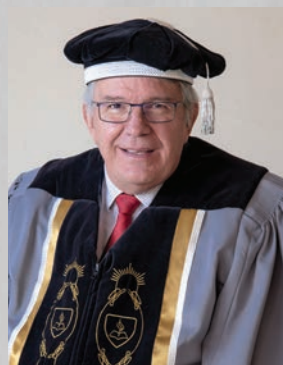
DEAN: THEOLOGY AND RELIGION