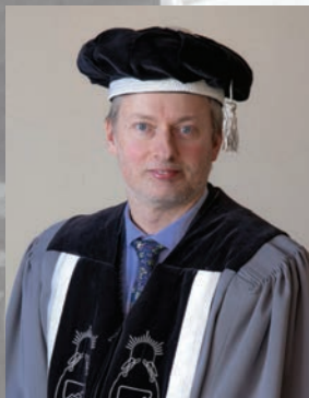
ACTING DEAN: ECONOMIC AND MANAGEMENT SCIENCE