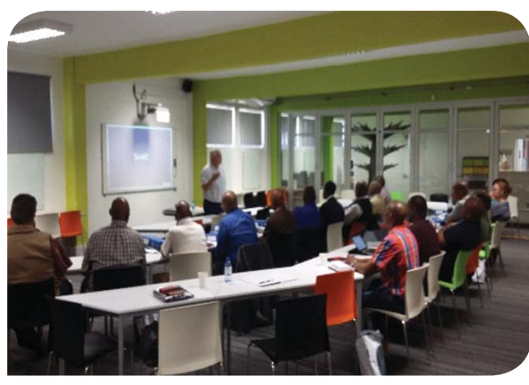
Tutor workshop (October 2019)