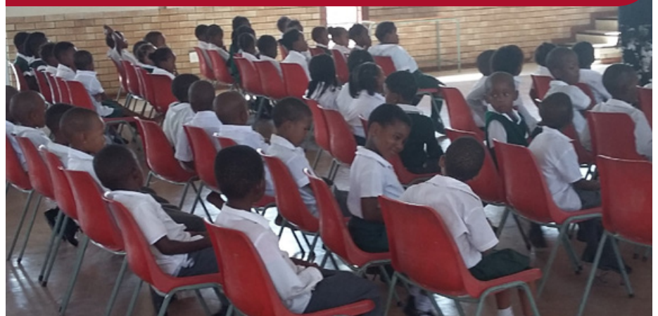
Grade 1 children listening to the stories