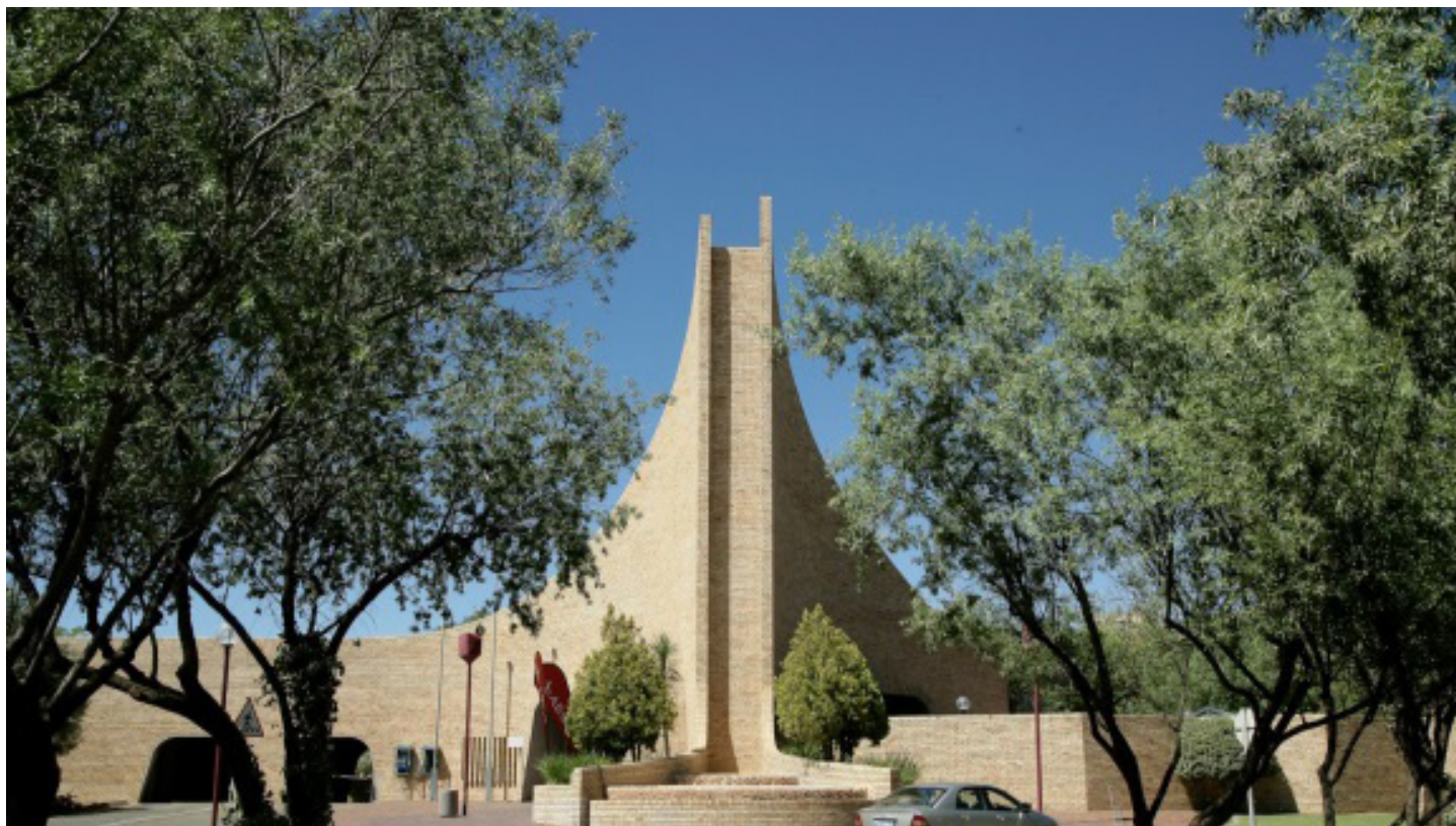
Entrance: south campus

The South Campus library recently purchased three tablets. A tablet is one of the most fun, user-friendly devices to work on. It is a very helpful device to search information on in the library, which makes it perfect for students. On regular PCs or laptops you can show people a book record or a database search. On a tablet, you can physically hand them the record or the search and allow them to view it, interact with it, and make it their own. The physical act of handing someone information should not be discounted.