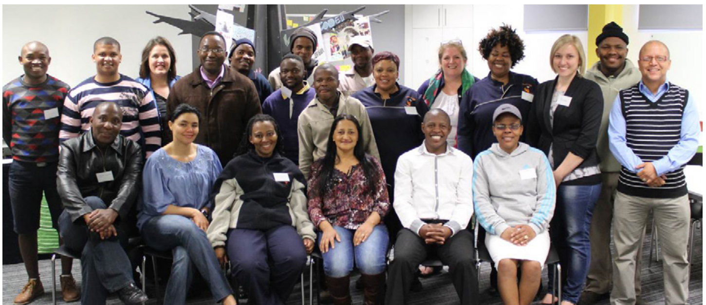
One of the 1st service worker, Introduction to Computers courses in 2015.