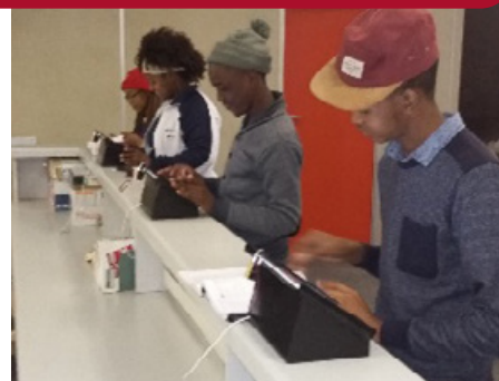
Tablets in the library available for students