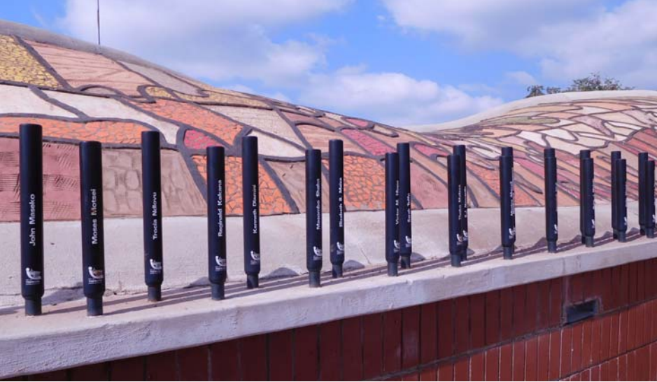
Names of the victims of conflict in Mamelodi at the Mamelodi Memorial Wall, Solomon Mahlangu Square in Mamelodi, Tswhane/Pretoria