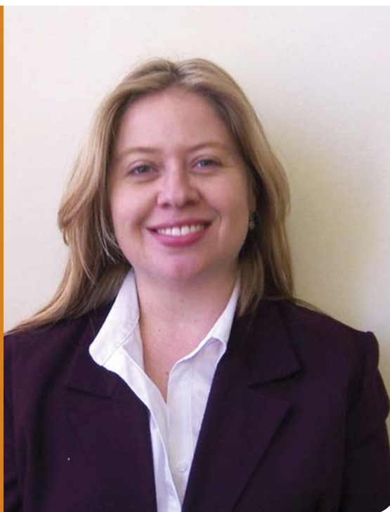
Director of CGAS (2020/2021)