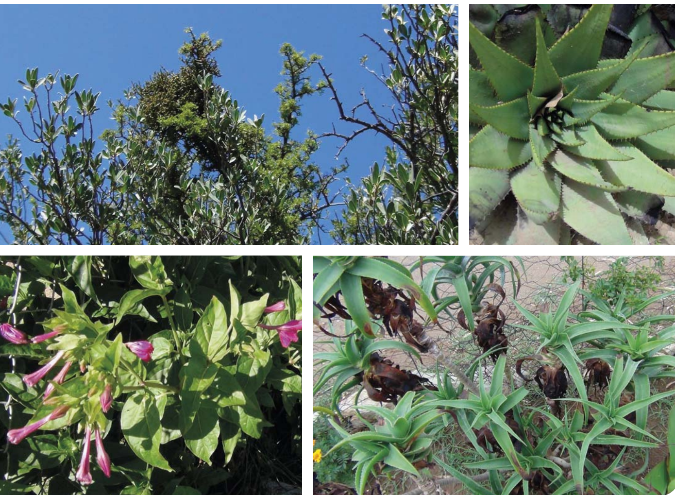
Examples of plant specimens harvested by the IKSDC in 2020

District, under the guidance of the Griqua Traditional Council: Bethulie, Koffiefontein, Philippolis, Bethane, Edenburg, Springfontein and Trompsburg.