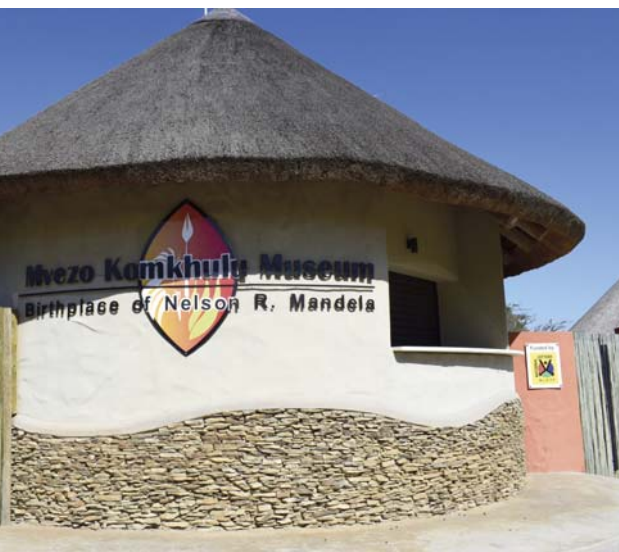
Mvezo birthplace of Nelson Mandela in Eastern Cape