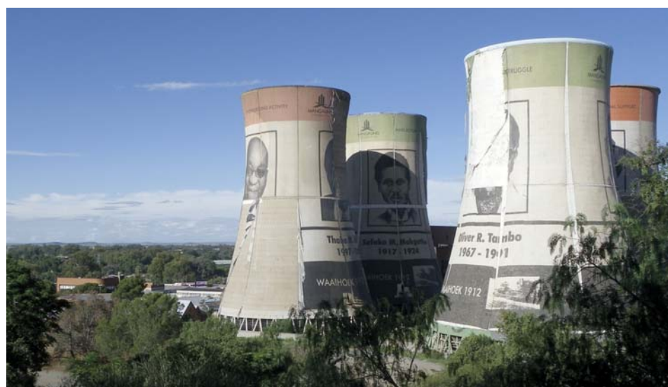
Old 'Waaihoek' district where ANC was established on 8 January 1912