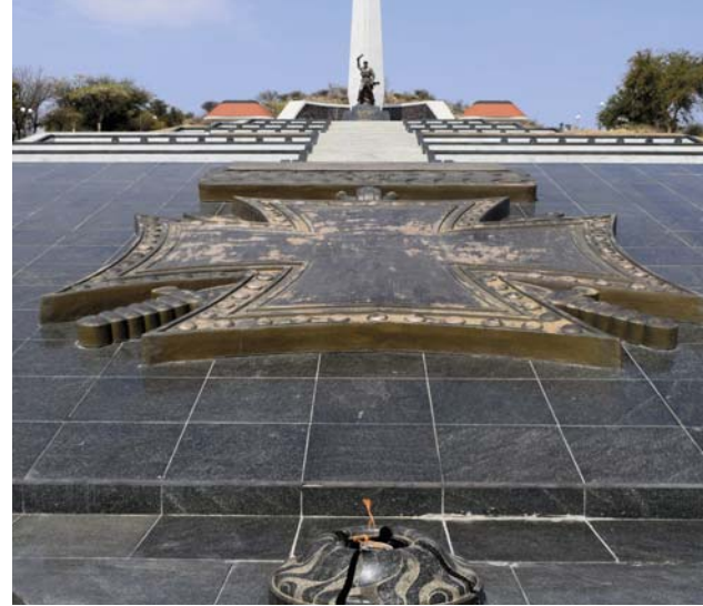
Heroes' Acre near Windhoek, Namibia