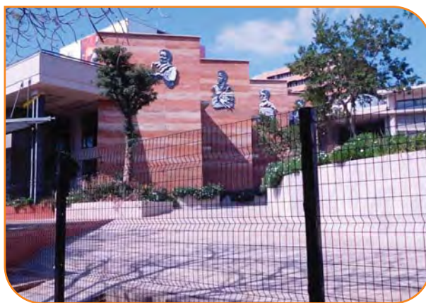
Women's Living Heritage Memorial in Pretoria/ Tshwane.