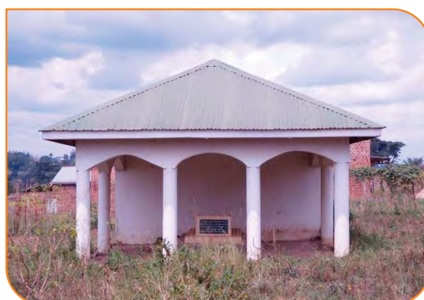
Mass grave memorials in the Luweero triangle, Uganda (Cawood).