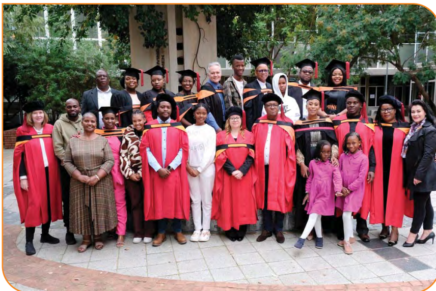
CGAS staff, graduating students and family members at the April 2023 graduation.

In 2023, across all its programmes and campuses, the CGAS collectively graduated a total of 80 students, with, inter alia, 59 students in the Bachelor of Community Development (graduating in April), five in the Bachelor of Honours (Gender Studies), seven in the structured MA (Gender Studies), and one in the Bachelor of Honours (Africa Studies).