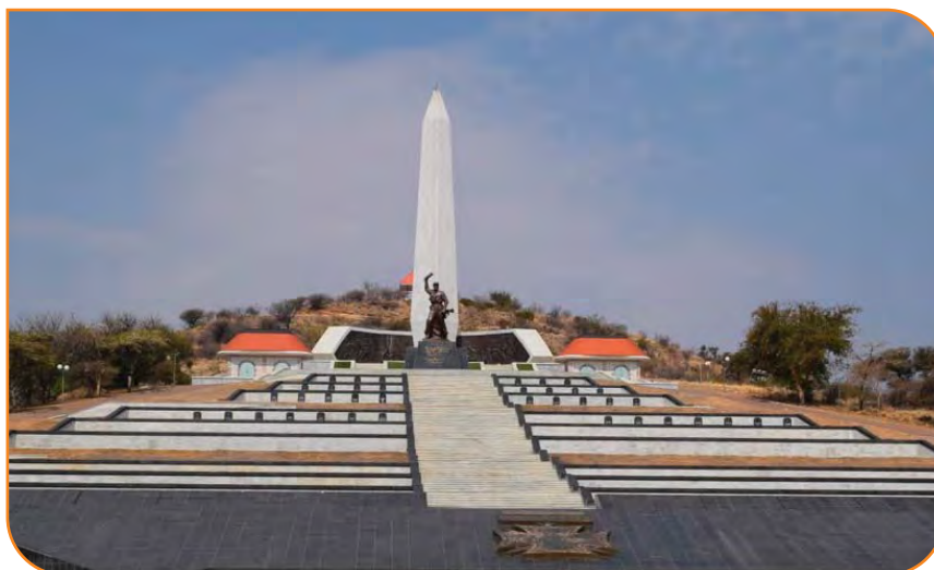
Caption: Research conducted as part of the Newton Advanced Fellowship (Cawood and Fisher) focusing on how liberation struggles are commemorated in post-liberation eras. Heroes' Acre (Windhoek) is one of the study sites pictured here.

memory, space and power in post-liberation Africa'. All fieldwork was concluded by 2019, and publications are in progress, with the first publication based on this research published in the Q1 Journal, Political Geography (Impact factor: 4.1) in November 2022. At least two more publications are currently in development.