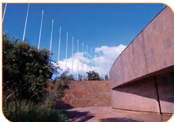
The Wall of Names at Freedom Park (Cawood).