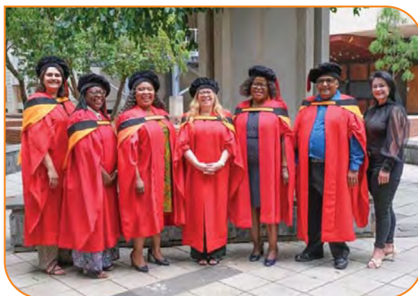
CGAS staff, PhD graduates and supervisors at the December 2023 graduation ceremony