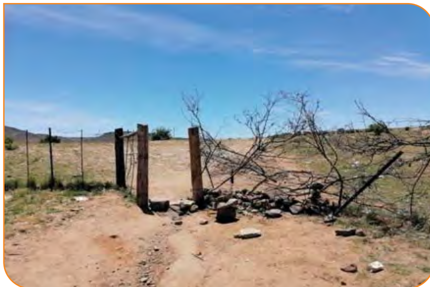
Caption: 'Paqama gate' (an informal border crossing) called 'at 60' close to Van Rooyen's Gate border post near Wepener documented during the 'Borderlands Project'.