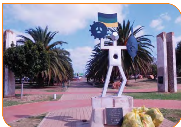
The memorial to fallen MK cadres at Solomon Mahlangu Square, Mamelodi (Cawood)