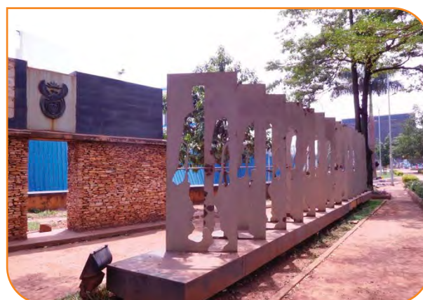
Kampala memorial to South African struggle activists who died in exile in Uganda (Cawood).