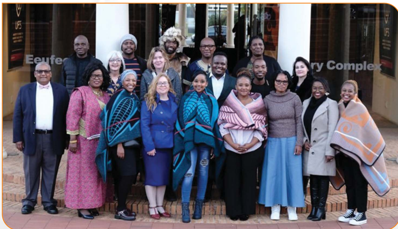
CGAS staff from Bloemfontein and Qwaqwa campuses attending the Africa Day Memorial Lecture in May 2023.