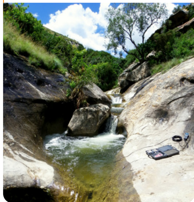
Collecting data through in situ water quality meters at Mautse