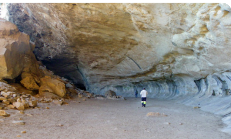
Inside Witsie's Cave, one of the sacred sites sampled in the eastern Free State