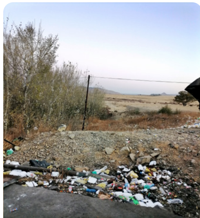
Part of the 'Borderlands' project, a well-known informal border crossing point at Maseru Bridge Border Post