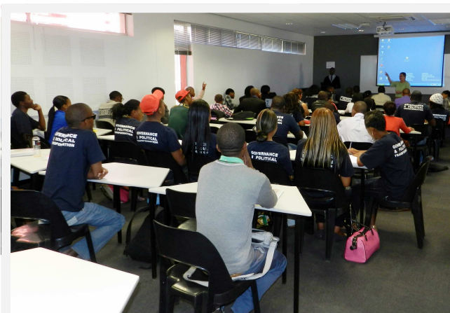
The service learning students busy making presentations to their classmates.

Students also had the opportunity to present their research findings, experience and very important, their understanding of governance and political transformation during a formal presentation to colleagues, students and the ward councillors of the different wards.