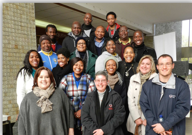
Students and facilitators during the workshop that took place on the second day of the Seminar.