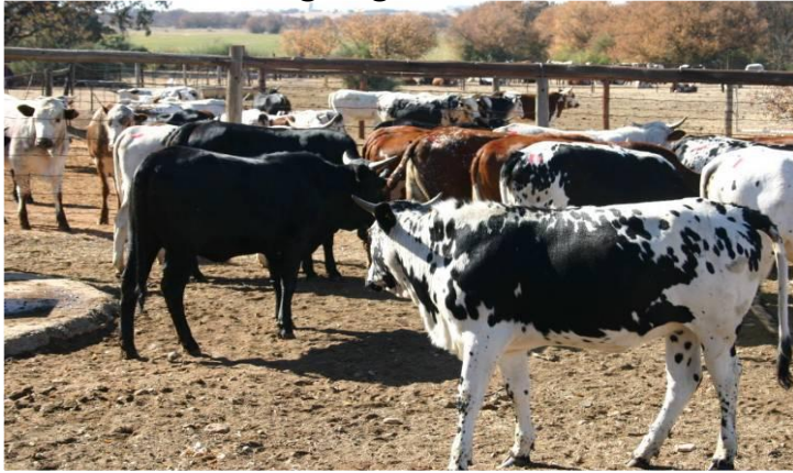
Young Nguni heifers