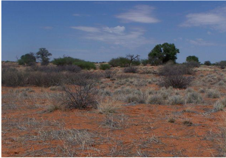
Typical Kalahari veld of the farm Khuis along the Molopo river on the Botswana border

The third batch of 10 Nguni heifers (now cows with calves at foot) and bulls will soon be on their way to the farm Khuis on the Botswana border