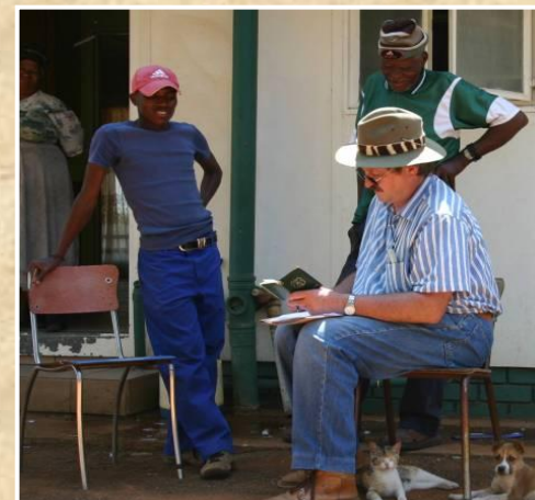
Signing the agreement between the Trust and the farmers – 23 October 2007