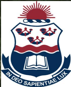
University of the Free State