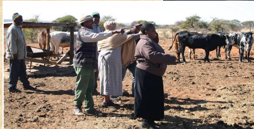
With the fingers pointing proudly, farmers said "...those are my Nguni heifers!"