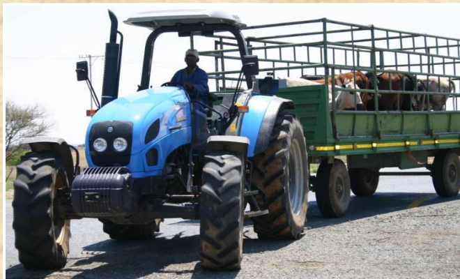
Transporting and offloading the Nguni heifers on Springfield - 23 October 2007