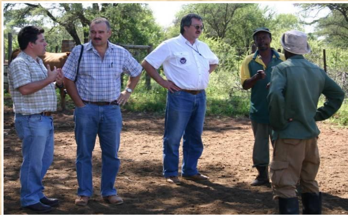
...discussing Nguni cattle...