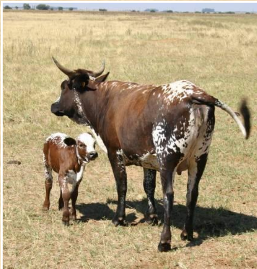
Nguni cow with a small calf

Two veterinarians confirming pregnancy in Nguni females on farm of Nguni Stud breeder - 29 June 2007