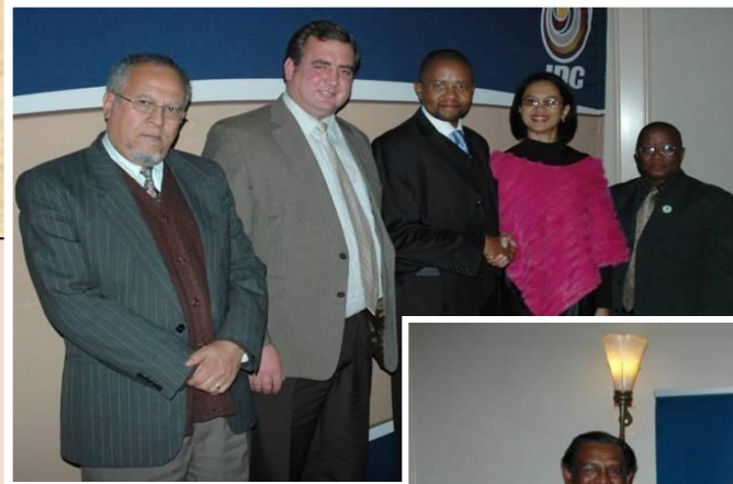
Dignitaries at the official signing ceremony in Kimberley – 7 June 2006