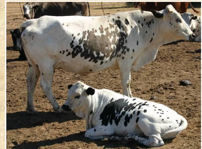
Nguni cow with a big calf