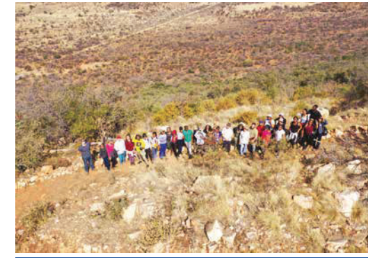
Economic and Exploration Geology students on a field trip in the Vredefort Dome