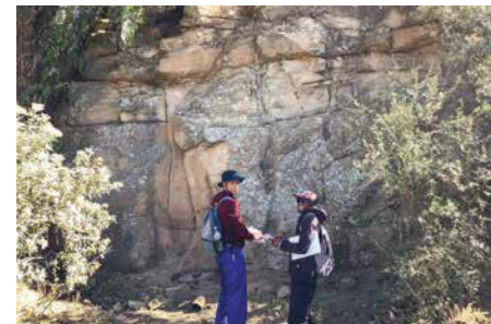
Second-year students investigating the stratified nature of cross-bedded units associated with the Musgrave Member, south of Bloemfontein

As part of their Environmental Geology module, second-year students undertook a field excursion in the second semester to the two municipal waste disposal sites in Bloemfontein. The field excursion provided students with practical lessons on some of the aspects that have to be considered when selecting solid waste disposal sites as well as some of the waste management issues that the city is currently facing.