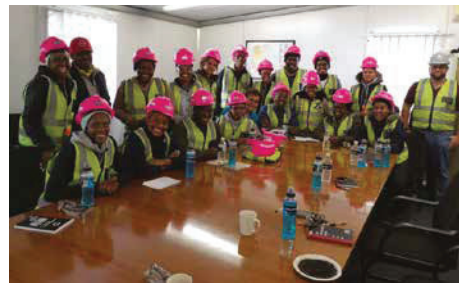
Mineralogy Honours students visiting the Gold One Mine Processing Plant

As part of the Department's intensive Honours programme, the 2019 Honours students undertook a number of field investigations and site visits. Applied and Advanced Mineralogy students visited the Sibanye-Stillwater Platinum Processing Plant (formerly known as Lonmin) and the Gold One Processing Plant located in Springs, as well as Mintek and SGS laboratories.