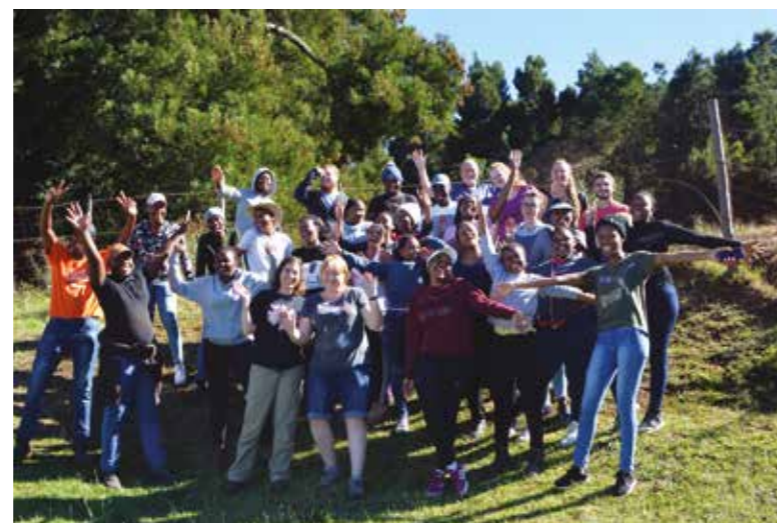
Students and staff during the 2019 Hogsback excursion

The third-year Botany students went on a field excursion to Hogsback in the Eastern Cape in February as part of their Field Excursion module. Students worked on projects including pollination biology, vegetation surveys in forest, grassland, wetland, fynbos and exotic plantations, identification and management of alien invasive plants, and identification of important plant families of South Africa.