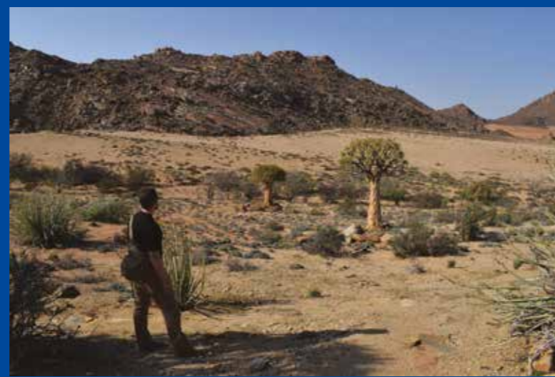
Field work at Goegap Nature Reserve in the Northern Cape for the Nemesia floral evolution project

Dr Lize Joubert's research focused on combining taxonomic approaches with pollination biology, flower evolution and development research to investigate various aspects of the diversity of South African flowering plants. Her research included topics such as floral adaptation to pollinator shifts because of climate change and optimisation of floral characters in crops for higher pollination efficiency and improved yield. In 2019 she conducted field work in the Northern and Western Cape to collect specimens and data for the Nemesia floral evolution project. She also collaborated with Dr Jackson on taxonomic revisions and molecular systematic analysis of key South African flowering plant groups.