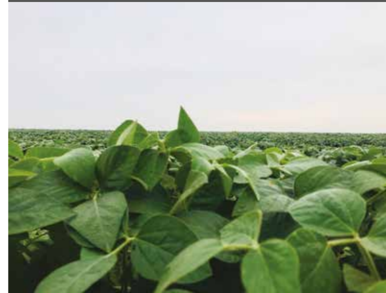
Healthy soybean plants