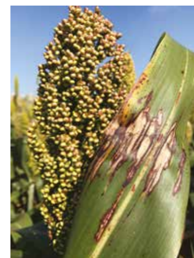
Sorghum leaf blight symptoms caused by Exserohilum turcicum