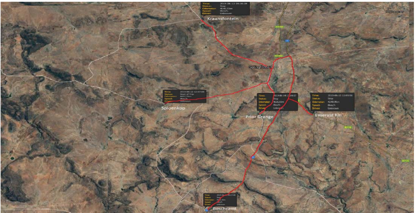
Figure 1B Shows the farms around Springfontein identified as daily sites