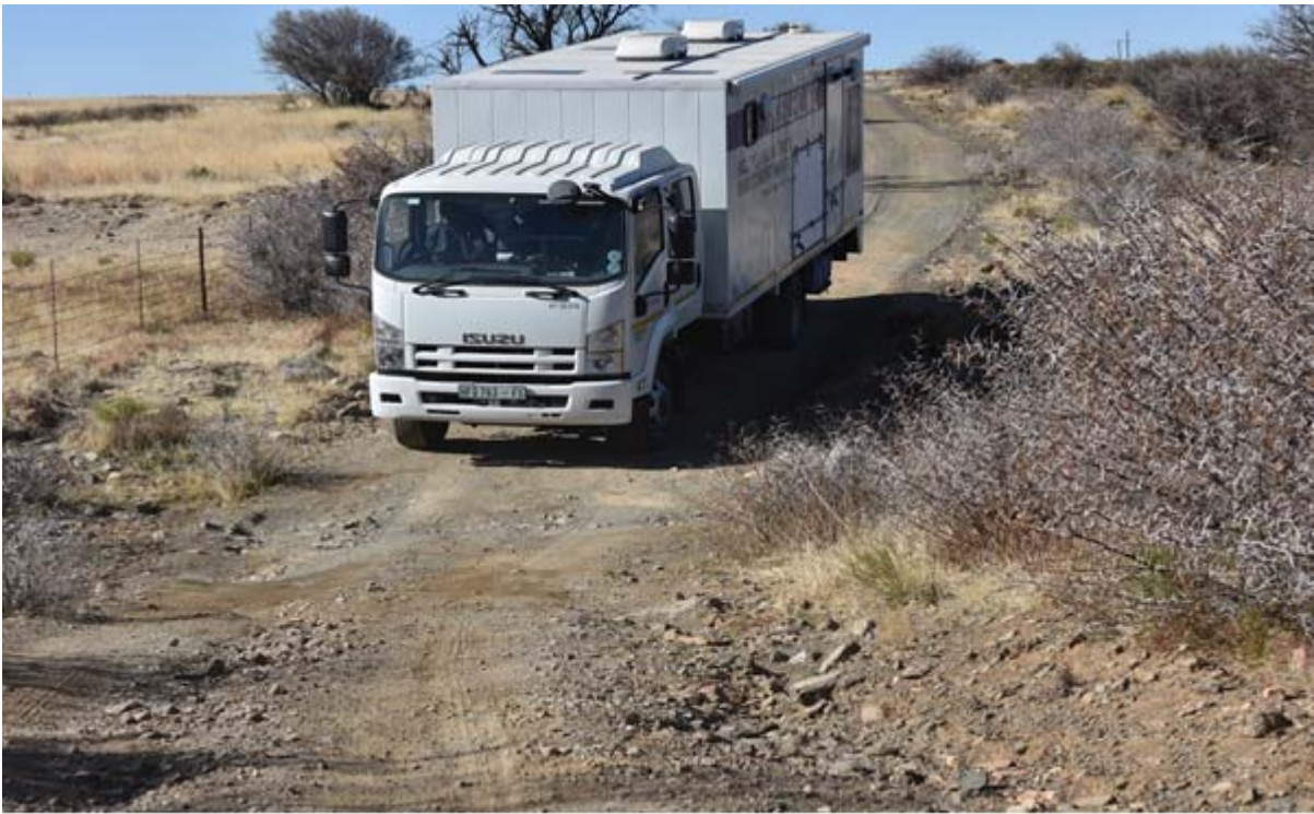
Figure 3A& B FHS mobile health service going boldly where no mobile has gone before

During the first six months of operation a total of 1329 patient visits were recorded.