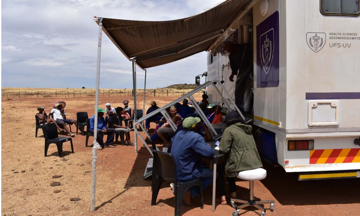
Figure 5 Faculty of Health Sciences fulfilling its social justice and teaching and learning mandate

The services offered include the FSDoH's Primary Healthcare Package: HIV, TB, mother and child health, immunisations, chronic disease management, etc. From the FHS additional services such as optometry, and other allied health services such as physiotherapy and occupational therapy will be offered. A Service Level Agreement outlines the service, roles and responsibilities of the signatories (FSDoH and FHS, UFS) to the agreement.