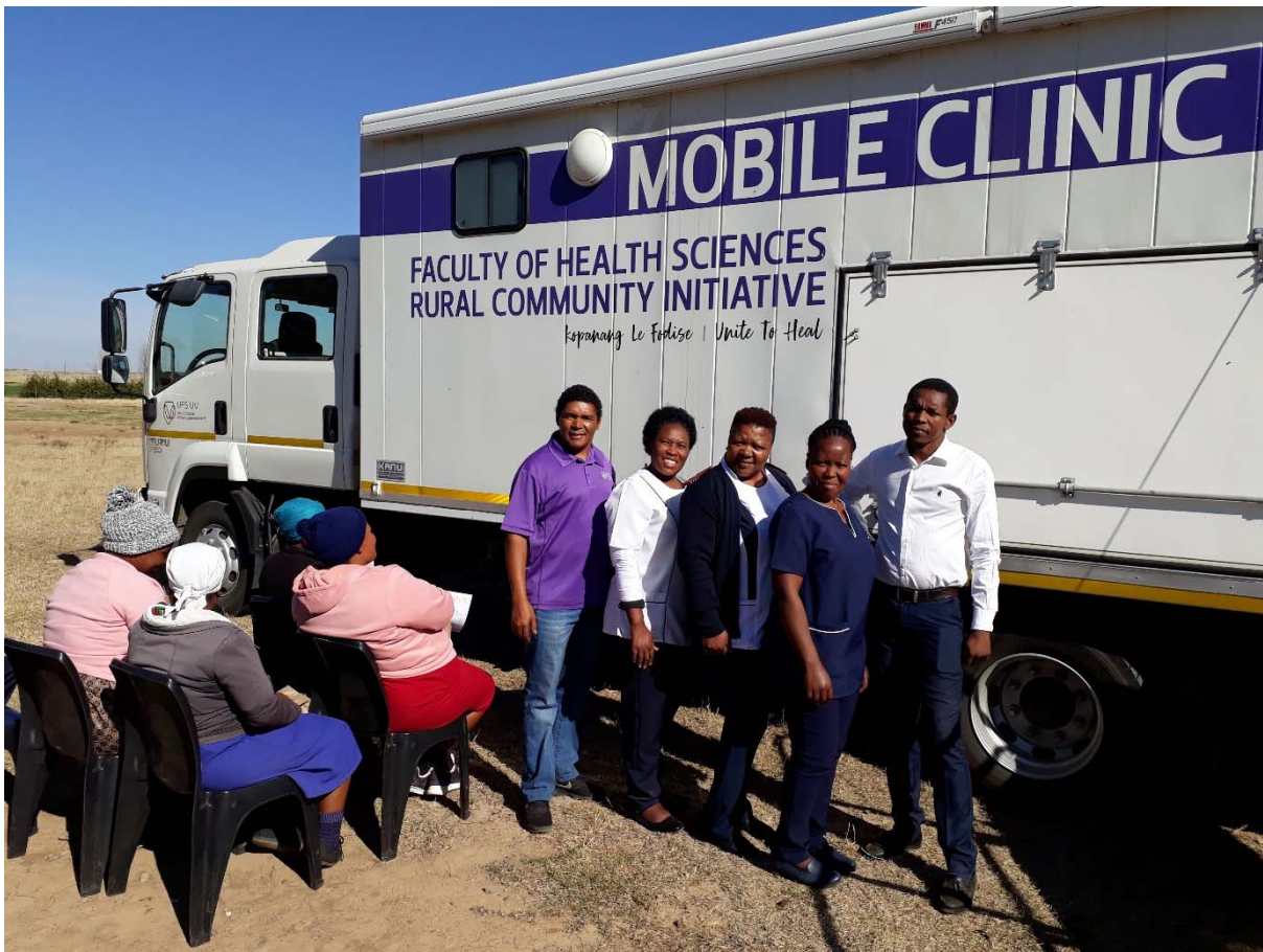
Figure 2 Personnel providing mobile health services

Though the above maps provides clear locational information, the sometimes vast distances (some days \pm 30\text{km} dirt road) can only truly be experienced as part of the crew; figure 3A and B provides some context.