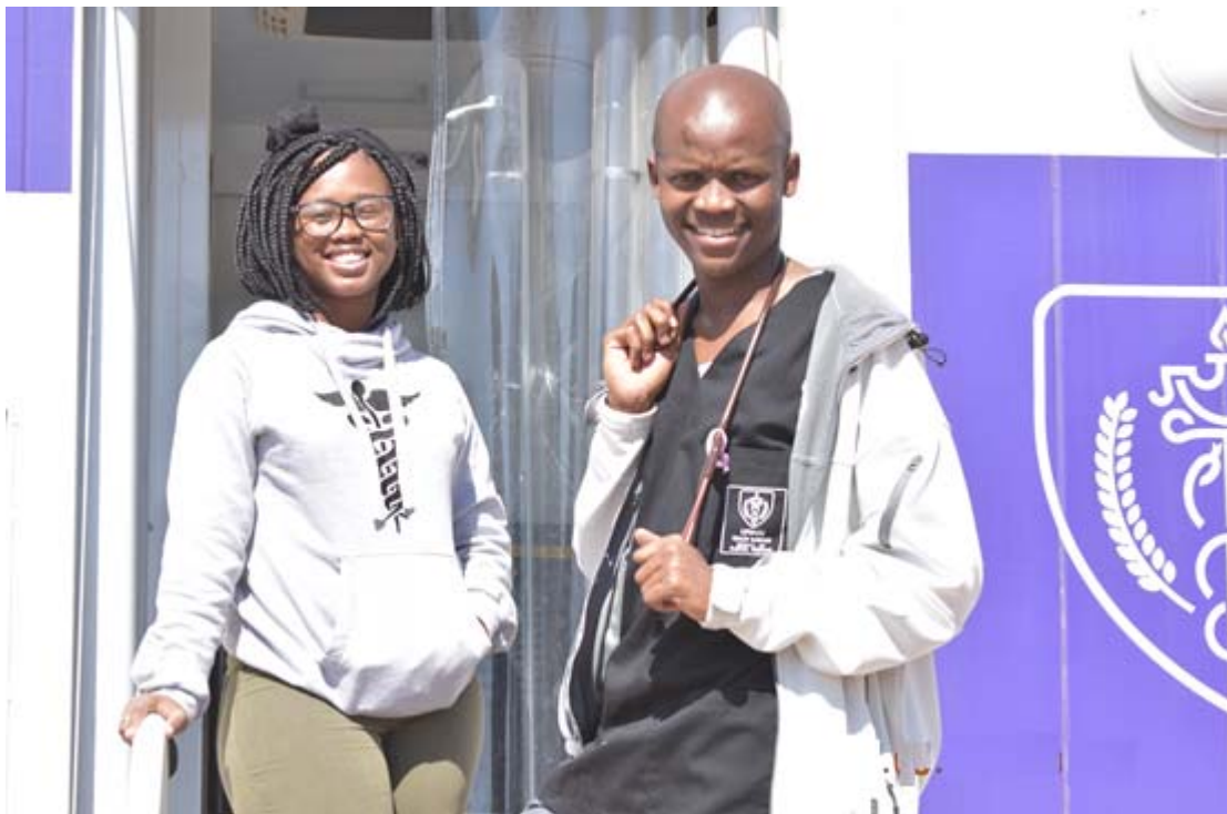
Figure 4 Students providing essential services during these authentic learning sessions

Students from the Schools of Allied Health Professionals, Clinical Medicine (figure 4) and Nursing will accompany FSDoH personnel during the visits.