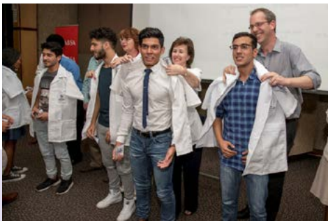
Students receiving their white coats.

In the School of Clinical Medicine, first-year students can look forward to an array of support sessions and special events to highlight their first year. During the annual White Coat Ceremony, all first-years are ceremonially presented with their white coats for the first time, taking an oath by the World Medical Organisation and committing themselves to their professional identity as future healthcare professionals.