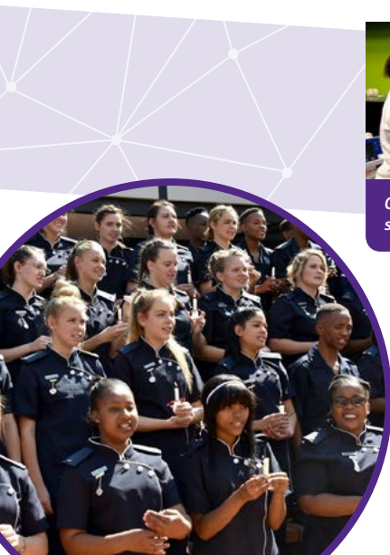
First-year Students – Oath taking during uniform ceremony.

Nurses who have completed their nursing qualification in the School of Nursing at the University of the Free State are highly regarded globally. Numerous excellent job opportunities exist after completion of the degree. Students exit the Bachelor of Nursing (B(Nursing)) with a general nursing and midwifery registration with the South African Nursing Council (SANC).