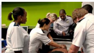
Clinical practical in simulation laboratory.