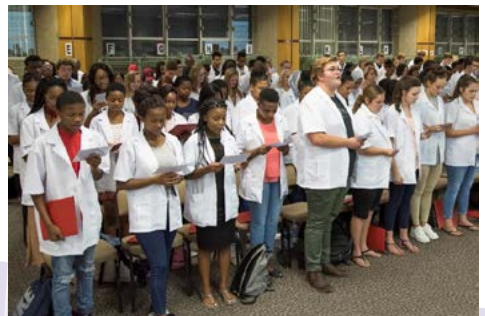
Students taking the oath at the White Coat Ceremony.