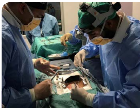
Cardiothoracic surgeon training on the Califa cardiac simulator.

The CSSU provides training in simulation for educators from all over Africa.