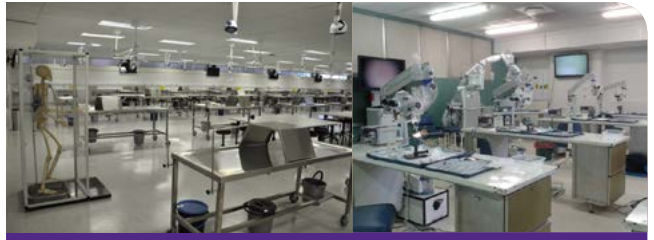
Dissection hall facilities.