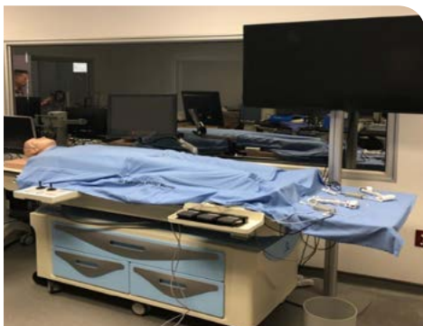
Virtual Cath lab for training of coronary and other vascular procedures.