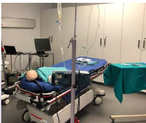
Medical emergencies in paediatric anaesthesia course.