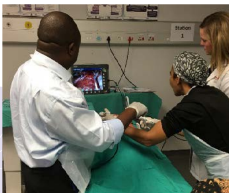
Training of laparoscopic skills on the virtual reality laparoscopic simulator.