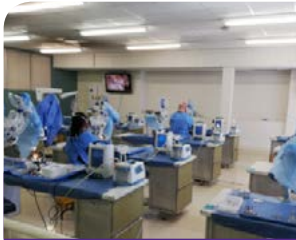
Clinical workshops presented.

The spacious dissection hall is a world-class facility that is equipped with special lighting and modern equipment for the training of undergraduate and postgraduate medical students. The hall is equipped with high-quality sound, computer equipment, and a unique camera system that allows students to follow dissection demonstrations on ten screens in the hall. Dissection demonstrations are recorded, enabling lecturers to compile new visual aid material for teaching and learning. This facility is also used for clinical workshops and postgraduate teaching seminars and workshops. The Anatomy workshop provides embalmed specimens to various clinical departments for training workshops, e.g., orthopaedics, anaesthetics, obstetrics and gynaecology, and otorhinolaryngology.