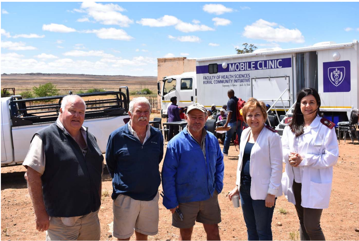
Figure 3 Faculty members with farmers and members from the Springfontein Agricultural Union

Faculty members met most of the farm owners as well as other farmers that transported their personnel from surrounding farms (figure 3). The purpose of the pilot was also to introduce the service to the farming community. All were very excited and indicated that the mobile clinic would be helpful for themselves and their personnel. The farming community (personnel and their dependents) was very appreciative for the intervention and cannot wait for the full service which is to start in April 2019.