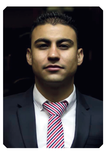
Lawyer & Acting Magistrate at Department of Justice and Constitutional Development