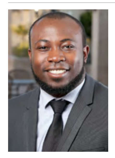
Acquisition and Leveraged Finance Deal Maker: Rand Merchant Bank