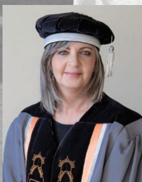
DEAN: THE HUMANITIES