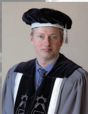
ACTING DEAN: ECONOMIC AND MANAGEMENT SCIENCE