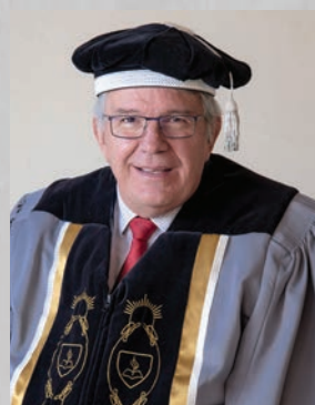
DEAN: THEOLOGY AND RELIGION