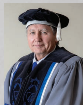
DEAN: NATURAL AND AGRICULTURAL SCIENCES