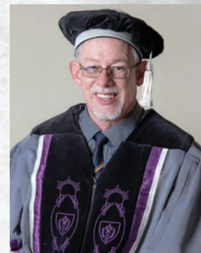
DEAN: HEALTH SCIENCES