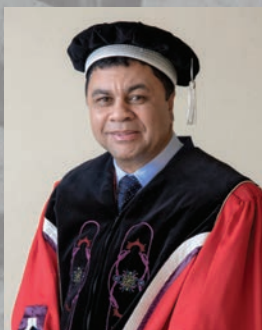
RECTOR AND VICE-CHANCELLOR