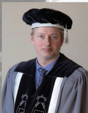
ACTING DEAN: ECONOMIC AND MANAGEMENT SCIENCE