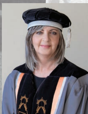
DEAN: THE HUMANITIES