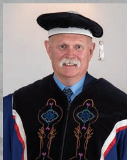
CHAIR OF COUNCIL