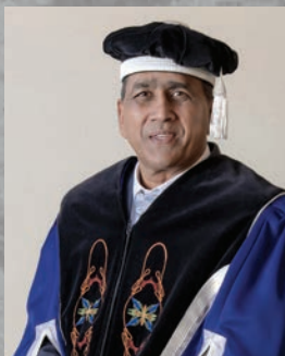
VICE RECTOR: OPERATIONS