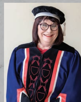
CAMPUS PRINCIPAL: SOUTH CAMPUS