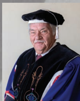
PRESIDENT OF CONVOCATION