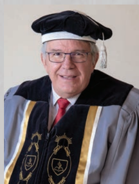
DEAN: THEOLOGY AND RELIGION