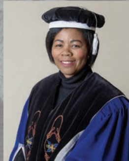
VICE-RECTOR: INSTITUTIONAL CHANGE, STUDENT AFFAIRS AND COMMUNITY ENGAGEMENT