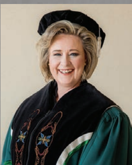
ACTING REGISTRAR: GOVERNANCE AND POLICY