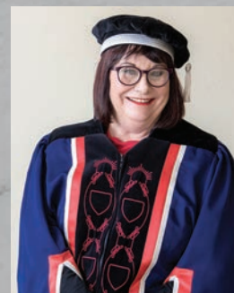
CAMPUS PRINCIPAL: SOUTH CAMPUS