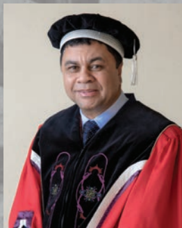
RECTOR AND VICE-CHANCELLOR