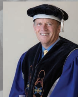
ACTING VICE-RECTOR: ACADEMIC