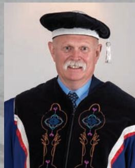
CHAIR OF COUNCIL