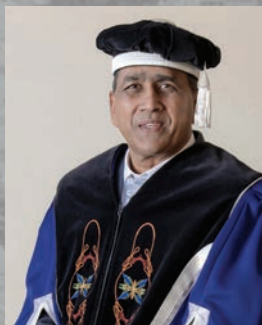
VICE RECTOR: OPERATIONS