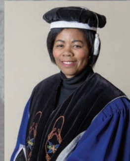
VICE-RECTOR: INSTITUTIONAL CHANGE, STUDENT AFFAIRS AND COMMUNITY ENGAGEMENT