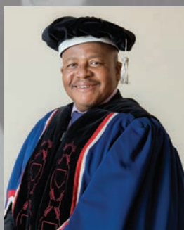
CAMPUS PRINCIPAL: QWAQWA