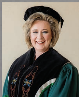
ACTING REGISTRAR: GOVERNANCE AND POLICY