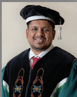
ACTING REGISTRAR: SYSTEMS AND ADMINISTRATION