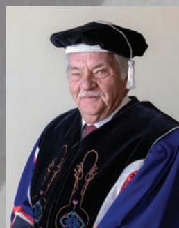
PRESIDENT OF CONVOCATION