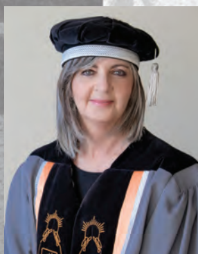
DEAN: THE HUMANITIES