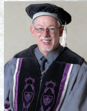
DEAN: HEALTH SCIENCES