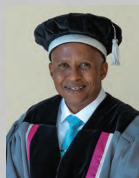
DEAN: STUDENT AFFAIRS