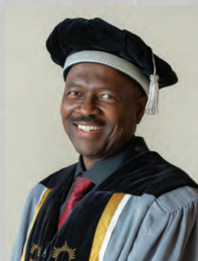
DEAN: THEOLOGY AND RELIGION