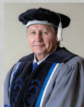
DEAN: NATURAL AND AGRICULTURAL SCIENCES