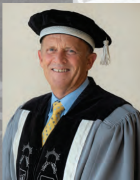
DEAN: ECONOMIC AND MANAGEMENT SCIENCES