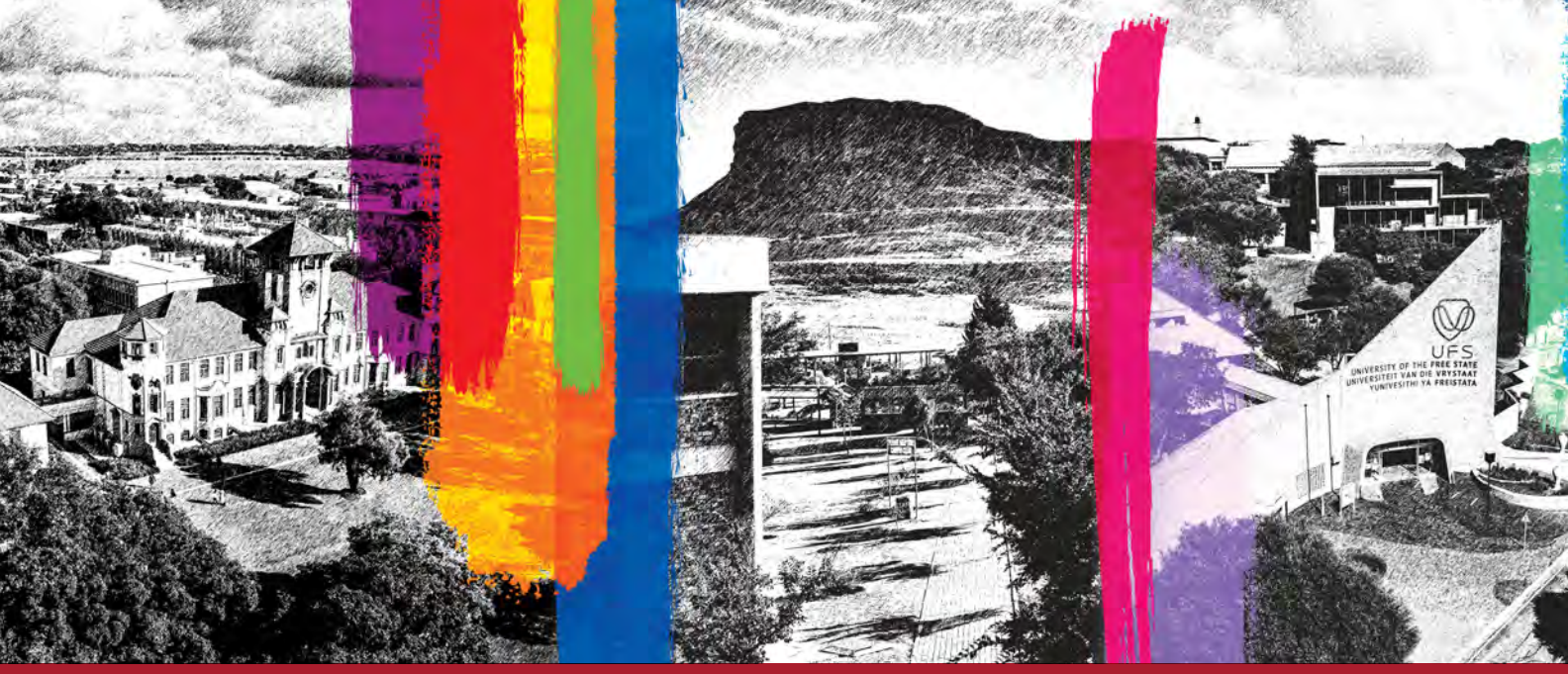
BLOEMFONTEIN, QWAQWA, AND SOUTH CAMPUSES