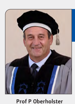
PhD (UP) DEAN: