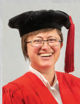
ASSISTANT DEAN: NATURAL AND AGRICULTURAL SCIENCES