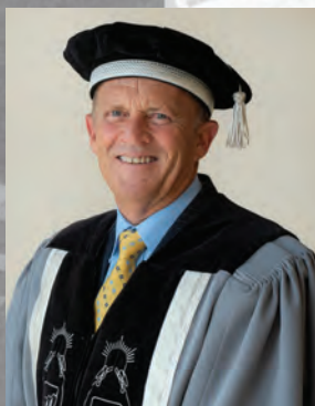
DEAN: ECONOMIC AND MANAGEMENT SCIENCES