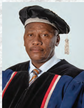
CAMPUS VICE-PRINCIPAL: SUPPORT SERVICES