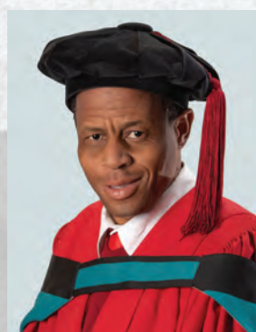
ASSISTANT DEAN: EDUCATION