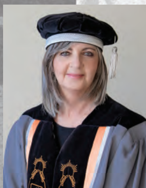
DEAN: THE HUMANITIES