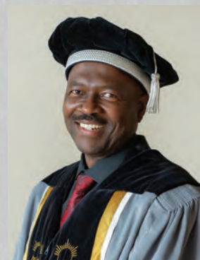
DEAN: THEOLOGY AND RELIGION