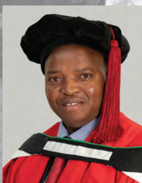
ASSISTANT DEAN: ECONOMIC AND MANAGEMENT SCIENCES