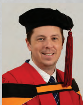
ASSISTANT DEAN: THE HUMANITIES