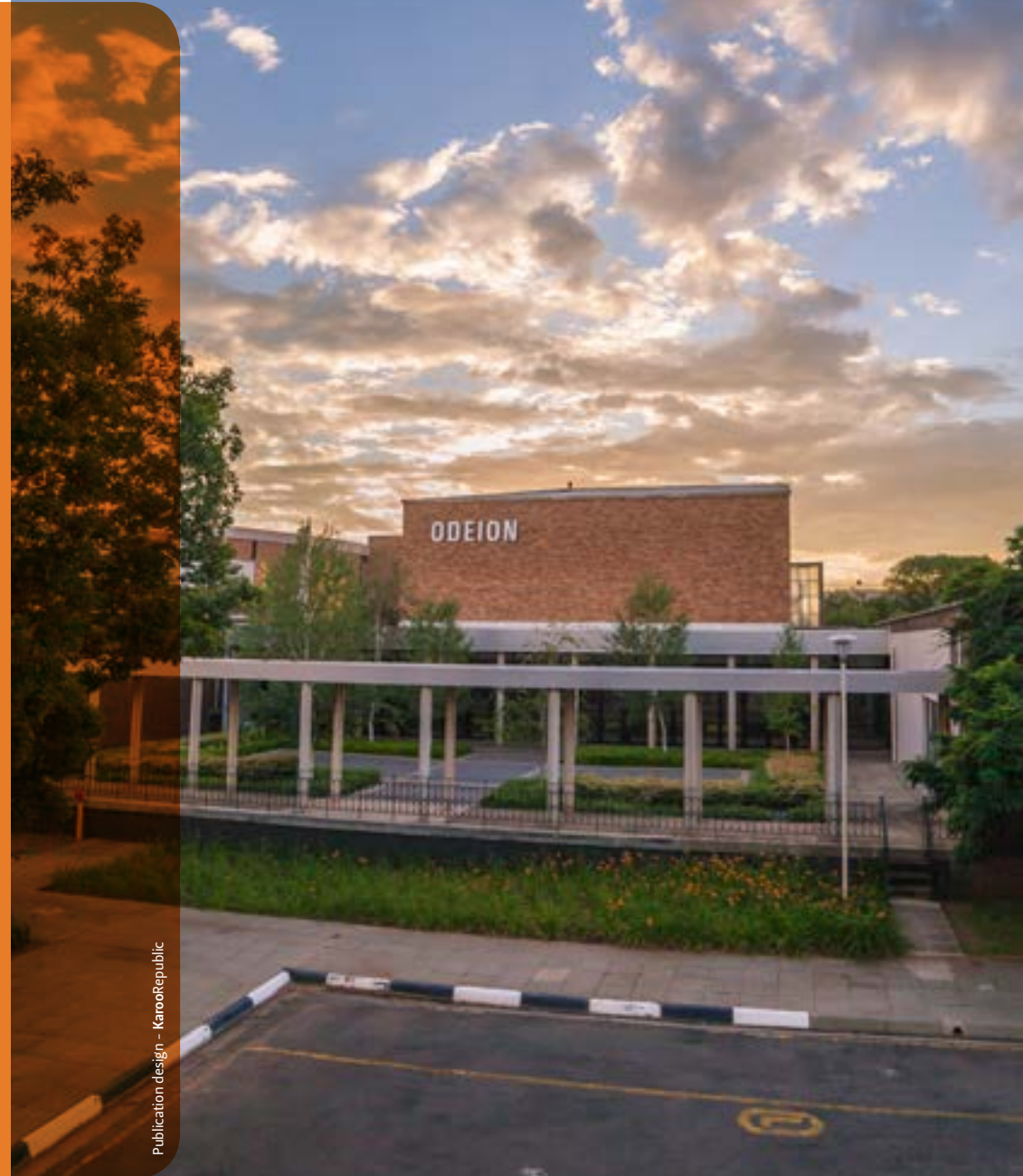
Publication design - KarooRepublic