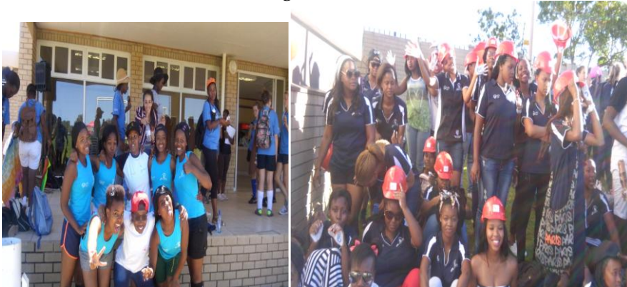
(First years at the swimming gala and the first year's soccer team)

The gateway meetings were specifically prescribed for the first years of the house and they showed great participation and commitment throughout the first weeks of gateway. The first years meeting (Athletics) was a great achievement because the first years enjoyed the events that were set for them as well as the spirit cup. They came on the 5 th position of the women competition out of 11 residences. The spirit of commitment carried out throughout the term.