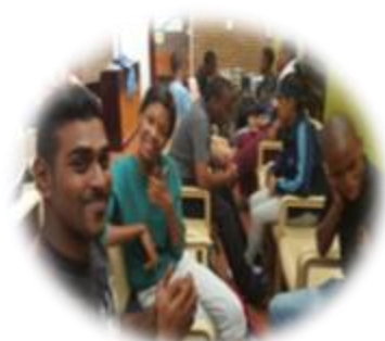
Inters were a great way for the Boys to meet people and socialise

It seems that most of my first years have settled in and have grown so much since meeting and sharing some experiences. From here, my primary aim is to ensure that their academics is of an excellent standard.