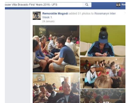
First year group among many interactive social media platforms.