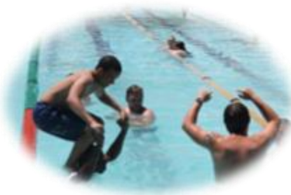
No better way to bond than in the pool.