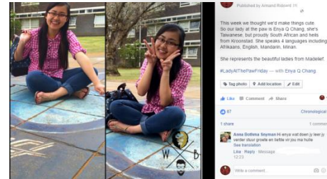
Weekly Bravado: Lady at the paw.

I thank my Subcom for the hard work they have put in advertising of large events like the parties. I look forward to greater things including the introduction of a large chalk Board with all the events.