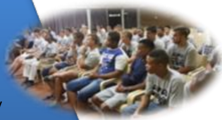
The gentlemen looking good in their uniform.