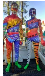
South College won the Body painting competition.