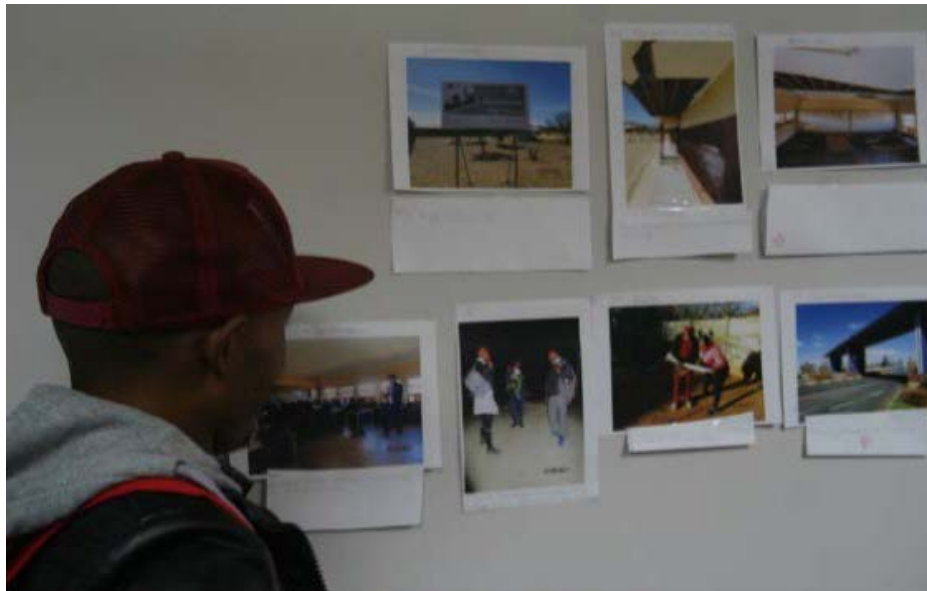
Figure 2: Presentations

As a group they decided on how, and with whom they wished to share the photo-essays. The group agreed on compiling an e-book; setting up a Facebook page; making contact with a Foundation which supports rural youth in accessing higher education; and organised a photo exhibition and a student staff presentation and discussion on the South Campus 1 of the University of the Free State. They also made short videos in which they talked about their experience of the project.