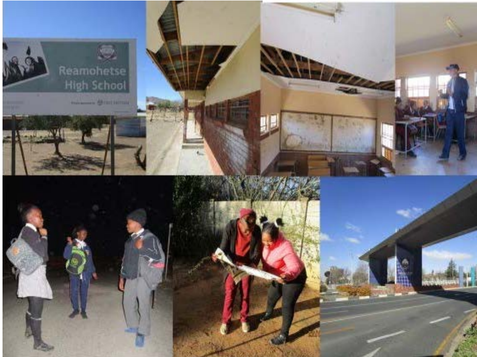
Figure 3: Getting to university, the importance of teachers

As a group they decided on how, and with whom they wished to share the photo-essays. The group agreed on compiling an e-book; setting up a Facebook page; making contact with a Foundation which supports rural youth in accessing higher education; and organised a photo exhibition and a student staff presentation and discussion on the South Campus 1 of the University of the Free State. They also made short videos in which they talked about their experience of the project.