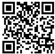
UFS Faculty Rules