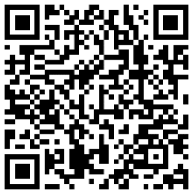
UFS General Rules