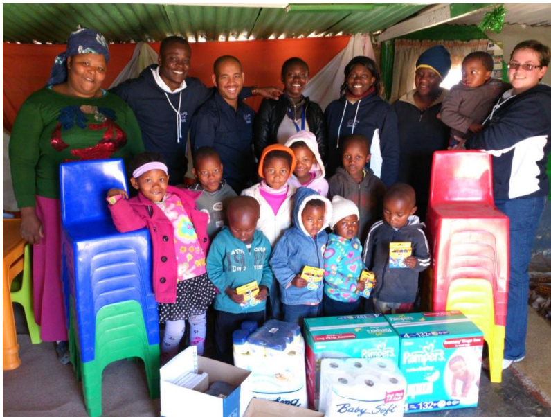
Postgraduate Student Council members with Tumelo Crèche kids and their teachers.

The Postgraduate Student Council is very grateful for the generous donation from the School of Nursing, University of the Free State towards the Mandela Day Project. We would also like to thank the SRC for their generous support.