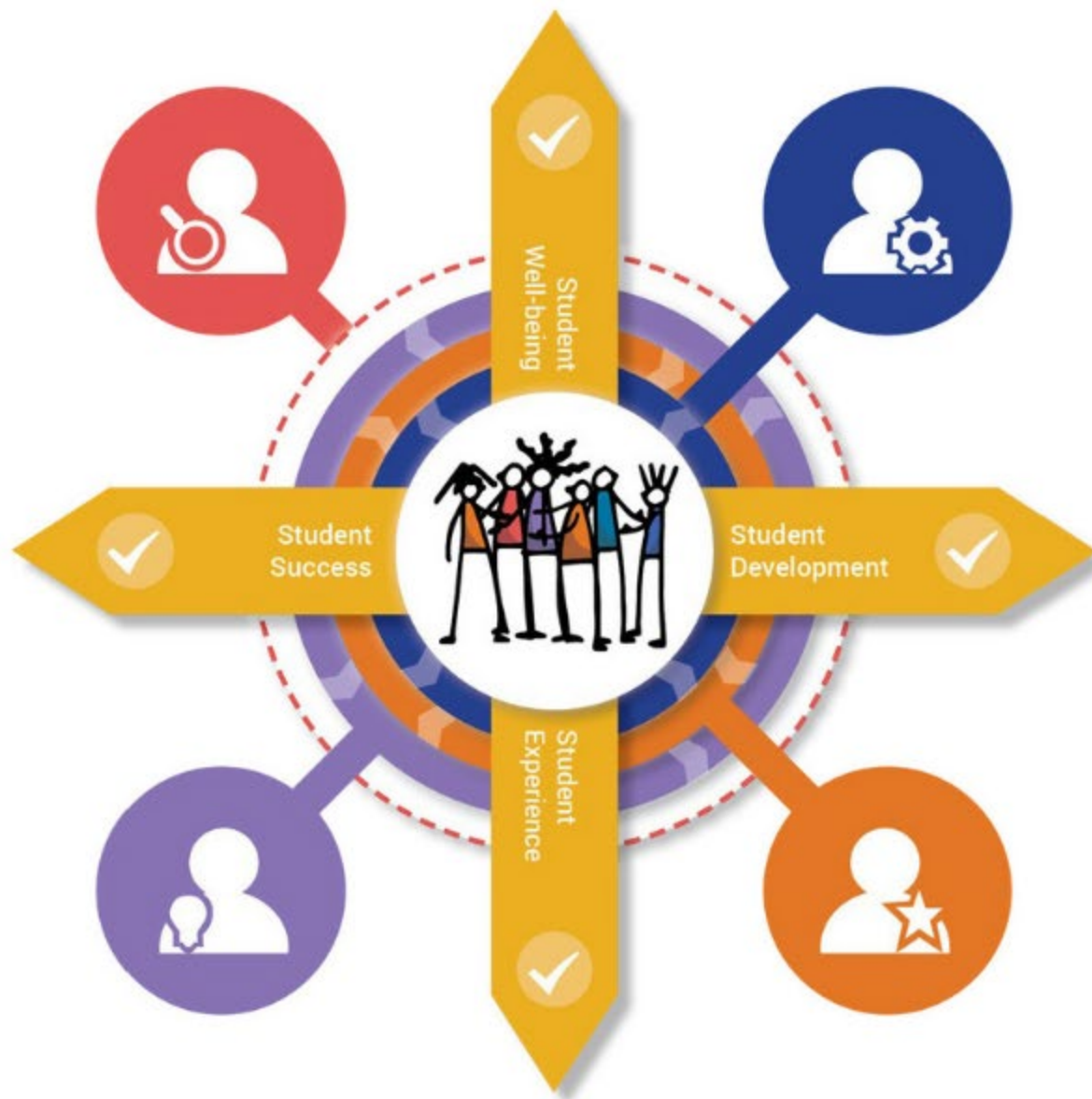
Figure 6: Circle of Analysts (Red)