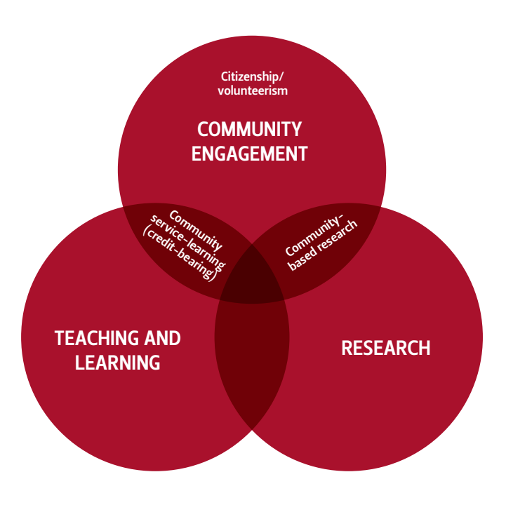
Figure 1. Intersecting model of Community Engagement at the UFS.

Community-oriented research intersected with teaching-learning and research respectively. Still, volunteerism continued where there was no intersection with teaching-learning or research, as depicted in figure 1 below.