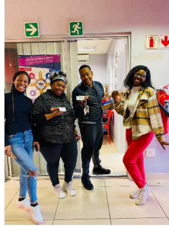
Ambassadors with staff members from Student Affairs