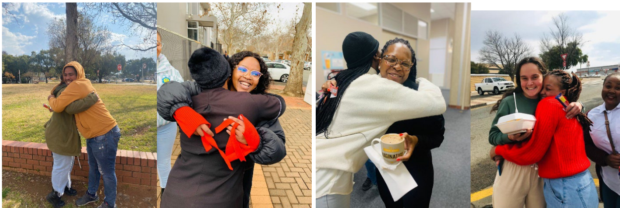
Ambassadors spent the day giving hugs to members of the UFS community

Designed to enhance the international and intercultural competencies of UFS students, the programme pairs first-entering international students with current UFS students, providing a warm, welcoming, and friendly face, a helping hand, and a first UFS friendship that makes a world of difference for the new arrivals. The programme adopts the UFS vision whereby every student will in the future have an international experience during UFS studies through internationalisation at home.