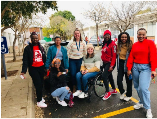
Ambassadors with students and staff from CUADS