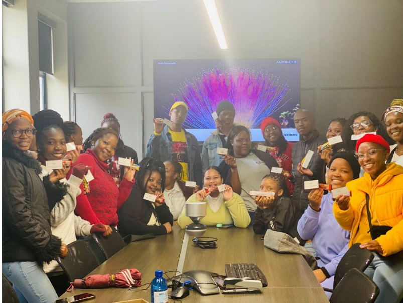
Umoja Buddy Programme Ambassadors

Designed to enhance the international and intercultural competencies of UFS students, the programme pairs first-entering international students with current UFS students, providing a warm, welcoming, and friendly face, a helping hand, and a first UFS friendship that makes a world of difference for the new arrivals. The programme adopts the UFS vision whereby every student will in the future have an international experience during UFS studies through internationalisation at home.