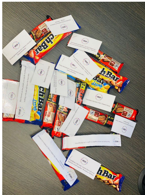
Messages on friendship and the chocolates

The Umoja Buddy Programme within the Office for International Affairs is celebrating International Friendship Day. As proclaimed by the United Nations (UN), International Friendship Day is celebrated by people on 30 July every year to recognise the values and the importance of friendships in promoting peace across cultures. The Umoja Buddy Programme celebrated this day by walking around campus, meeting different students and staff, and handing out chocolates and messages of friendship in celebration of this day – playing our part in promoting peace and unity within the campus community.