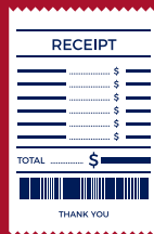
Proof of Payment