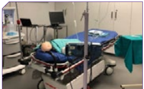
Medical emergencies in paediatric anaesthesia course.