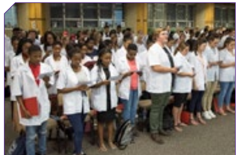
Students taking the oath at the White Coat Ceremony.