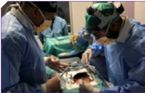
Cardiothoracic surgeon training on the Califa cardiac simulator.

The CSSU provides training in simulation for educators from all over Africa.