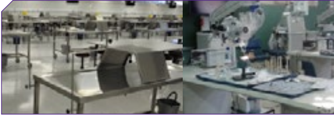
Dissection hall facilities.

The spacious dissection hall is a world-class facility that is equipped with special lighting and modern equipment for the training of undergraduate and postgraduate medical students. The hall is equipped with high-quality sound, computer equipment, and a unique camera system that allows students to follow dissection demonstrations on ten screens in the hall. Dissection demonstrations are recorded, enabling lecturers to compile new visual aid material for teaching and learning. This facility is also used for clinical workshops and postgraduate teaching seminars and workshops. The Anatomy workshop provides embalmed specimens to various clinical departments for training workshops, e.g. orthopaedics, anaesthetics, obstetrics and gynaecology, and otorhinolaryngology. Intra-osseous and ankle replacement workshops took place during 2019.