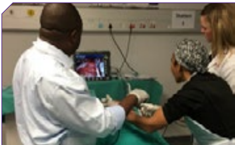
Training of laparoscopic skills on the virtual reality laparoscopic simulator.