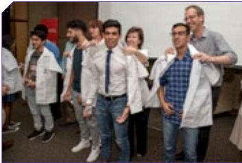
Students receiving their white coats.

In the School of Clinical Medicine, first-year students can look forward to an array of support sessions and special events to highlight their first year. During the annual White Coat Ceremony, usually held in February each year, all first-years are ceremonially presented with their white coats for the first time, taking an oath by the World Medical Organisation and committing themselves to their professional identity as future healthcare professionals.