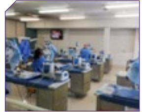
Clinical workshops presented.