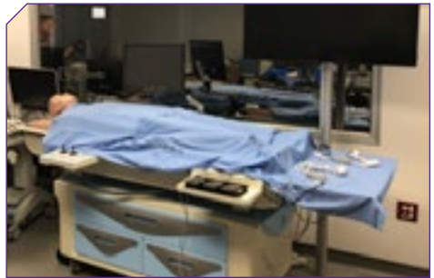
Virtual Cath lab for training of coronary and other vascular procedures.