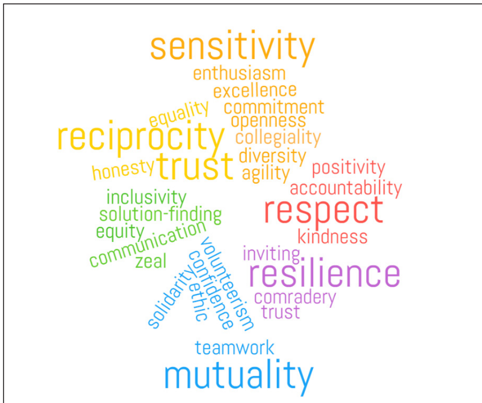
Figure 2: Display of common values

Although the values were listed in response to a particular question posed, they recurrently crystallised in responses to other questions.